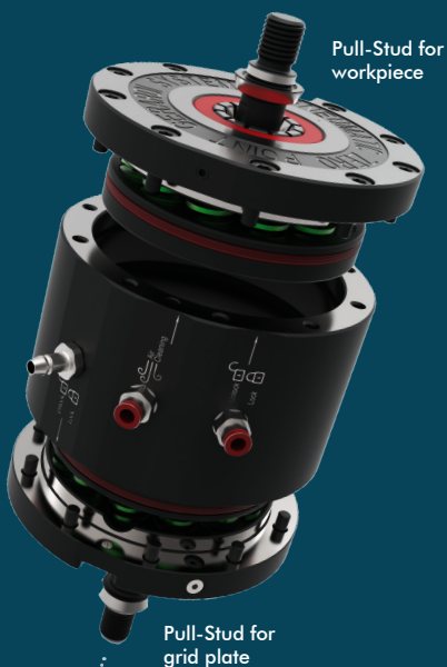
Pull-Stud for workpiece

Double Zero Point allows to change the position of the Zero Point units to clamp and position fixtures and workpieces even of different sizes on the same base plate.